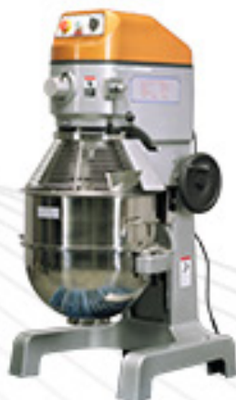
Planetary Mixer SP-30HA