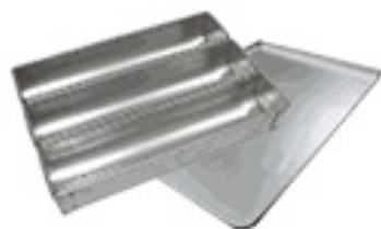
Moulds & Trays