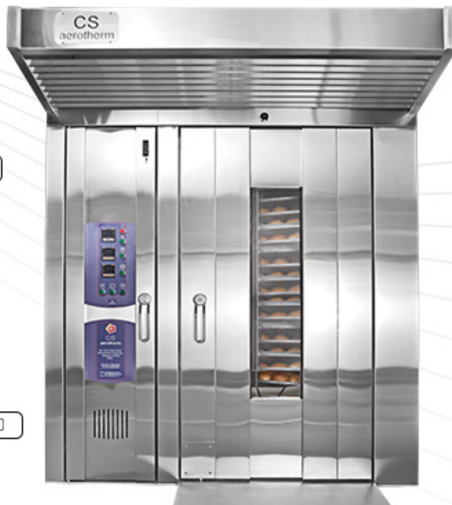
Rotary Rack Oven B-700