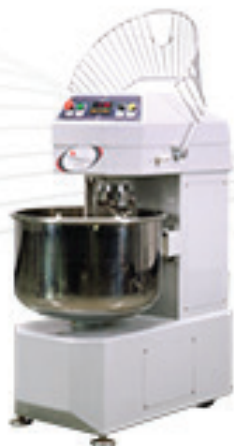
Spiral Mixer CSM-25