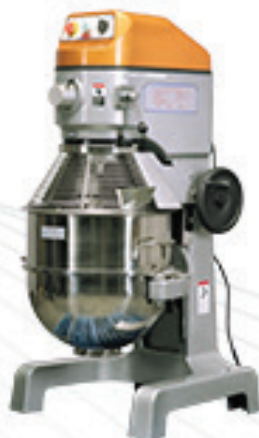
Planetary Mixer SP-30HA