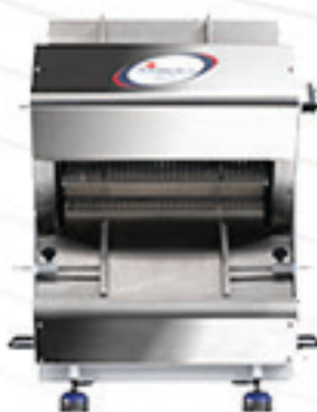
Table Top Slicer CSTTS-500