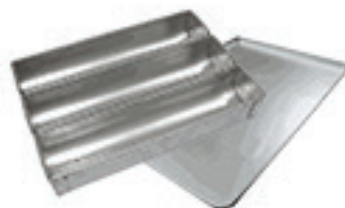
Moulds & Trays