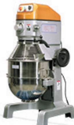
Planetary Mixer SP-60HA