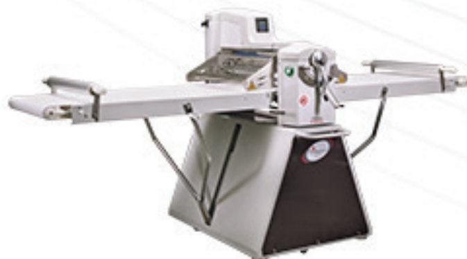
Manual Sheeter Easy 600