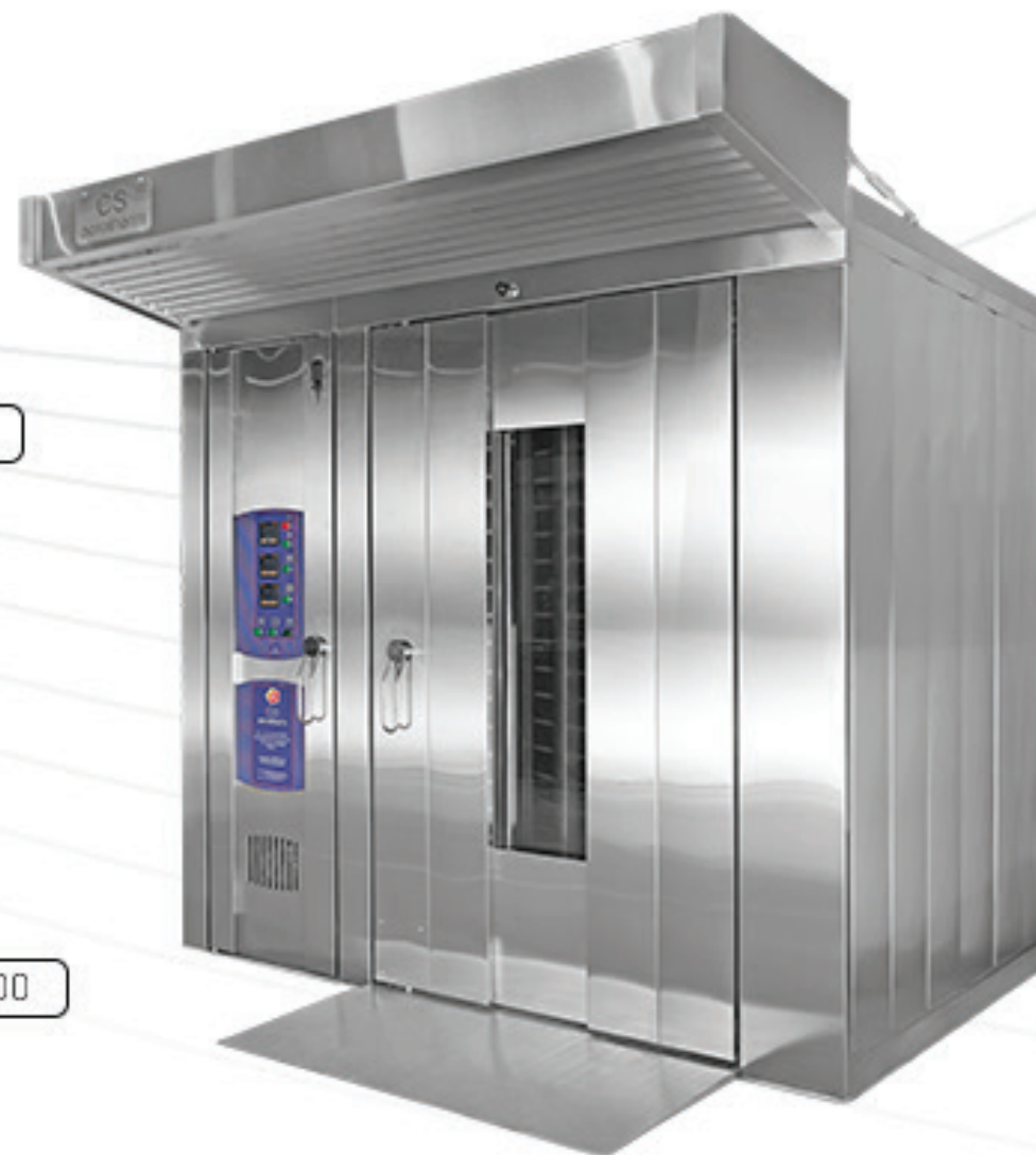
Rotary Rack Oven B-1300