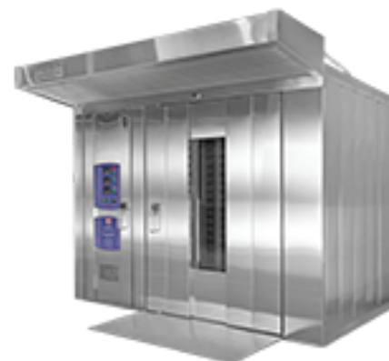
Rotary Rack Oven B - 1700