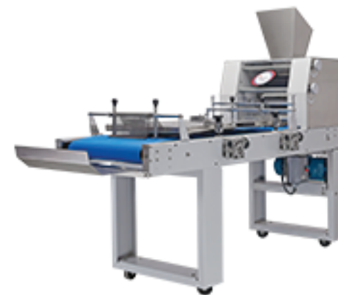
Economic Moulder LM-1500