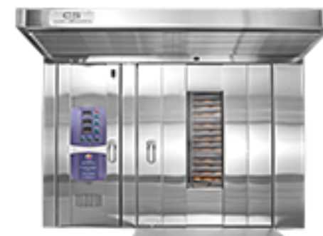
Rotary Rack Oven B - 2200