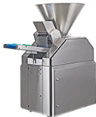
Single Pocket Divider