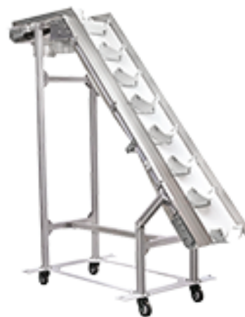
Take Off Conveyor