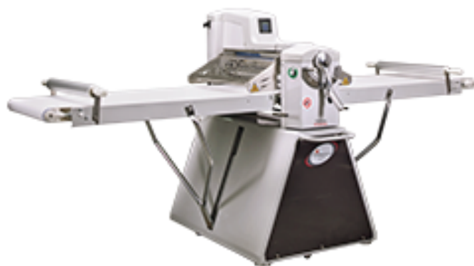
Manual Sheeter Easy 600