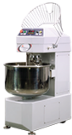
Spiral Mixer CSM-100